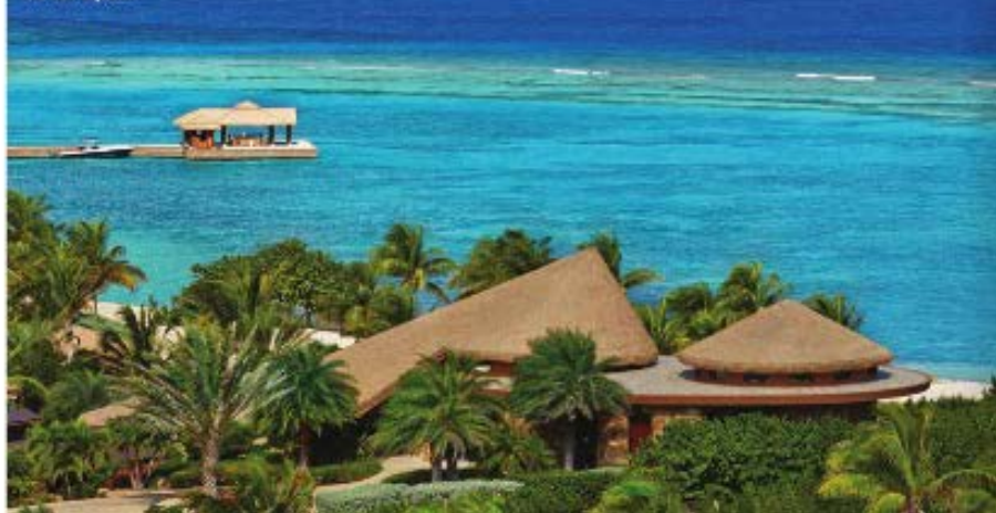
Oil Nut Bay, BVI

With the Rio summer games coming up in August, check into one of these fitness-focused retreats for some Olympic-inspired action!