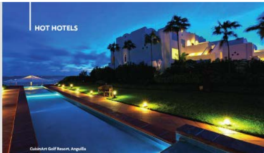
CuisinArt Golf Resort, Anguilla