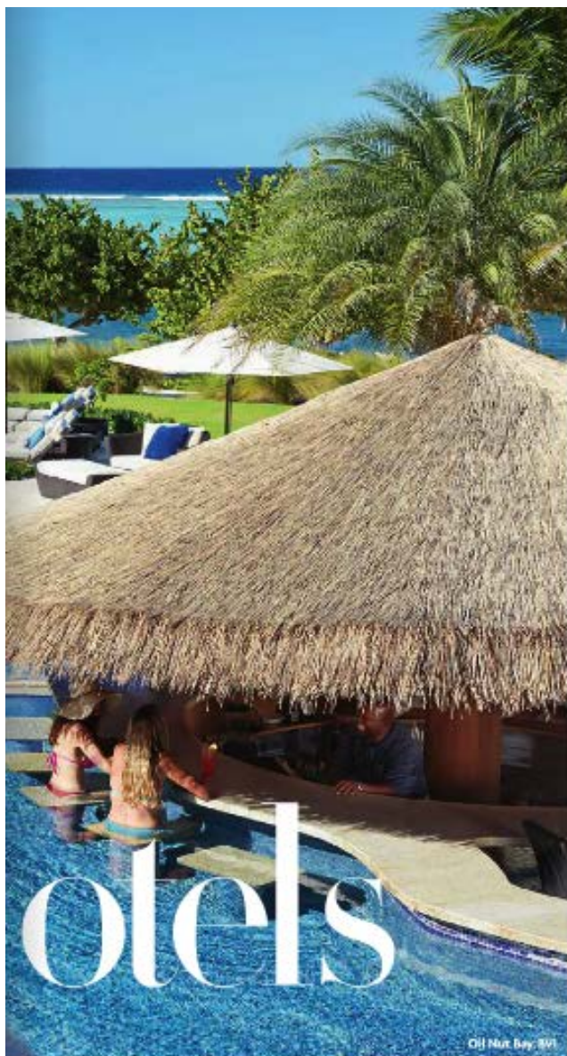
Oil Nut Bay, BVI