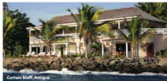
Curtain Bluff, Antigua

TAKE ME THERE: LIAT FLIES DIRECT TO ANTIGUA FROM ANGUILLA, BARBADOS, DOMINICA, GUADELOUPE, PUERTO RICO, ST KITTS, ST LUCIA AND ST MAARTEN ●